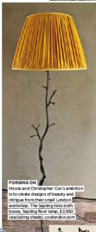
FORGING ON Nicola and Christopher Cox's ambition is to create designs of beauty and intrigue from their small London workshop. The Sapling ticks both boxes. Sapling floor lamp, £2,930 (excluding shade). co.london.com